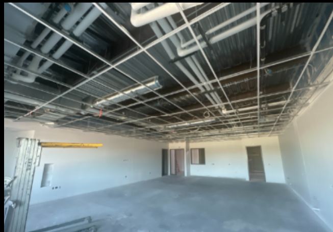
Paint & Ceiling Grid

DRYWALL INSTALLED / ON-SITE: 14,000 SHEETS