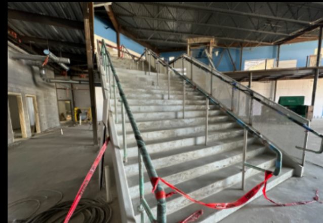
Stairs Installed and Poured