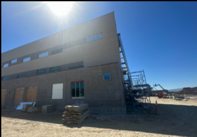
Brick Veneer at Classroom Wing