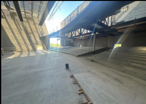
Slab on Grade in Auditorium